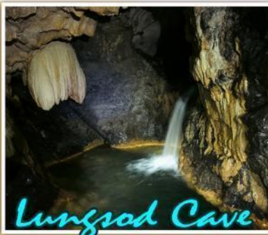
Lungsod Cave This waterfall is located inside the complex cave at sitio Pinagar, Bgy. Ransang.